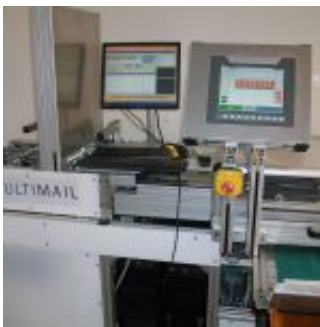
Smart camera optimizes letter sorting machines