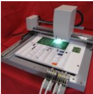
Desk mounting of SMD's