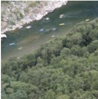
mvBlueLYNX for more safety on waterways