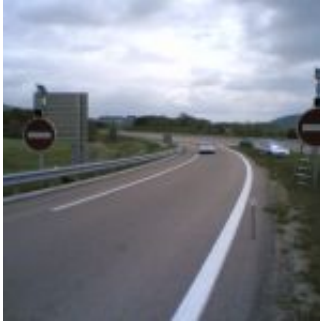
mvBlueLYNX for more safety on motorways